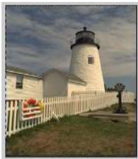
Fig.4. RGB Patching

Where v[n1, n2] is independent white Gaussian noise with variance \sigma^2 in the i^{th} channel ( [n1, n2] \in \Psi_i ). We have tested our noise estimation methods on two standard image data sets with added noise: the 768x512 Kodak images (KO), and the data set of 720 x 540 images made available by L. Condat [7] (LC).