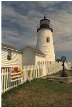
Fig.5. Fully generated color image

homogeneity- directed demosaicking by Hirakawa and Parks [5] four schemes. The zooming algorithm used is the nonlinear edge-directed interpolator proposed by Li and Orchard [7]. The fourth scheme used in comparison is a ‘‘CFA-zooming-first and demosaicking-later’’method. In this scheme, the CFA zooming algorithm proposed by Lukac et al. [9] is used to enlarge the CFA image first and the adaptive homogeneity- directed demosaicking by Hirakawa and Parks [5] is employed to generate the full color image.