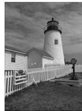
Fig. 3. Downsampled input image

location. Remember that before this interpolation that each location only had a R or G or B value; not a R value and a G value and a B value for each location. The algorithm creates values for each of the three colors at every location by smearing (interpolating) each set of partial R, G and B values to have values at every location. Conventionally, digital color images are represented by setting specific values of the color space coordinates for each pixel. The color spaces with decoupled chrominance and luminance coordinates (YUV type) allow the number of bits required for acceptable color description of an image to be reduced, and is based on greater sensitivity of the human eye to changes in luminance than to changes in chrominance.