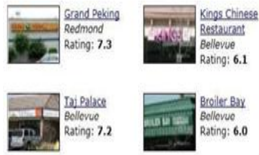
Fig 2. An example repeat region in a webpage